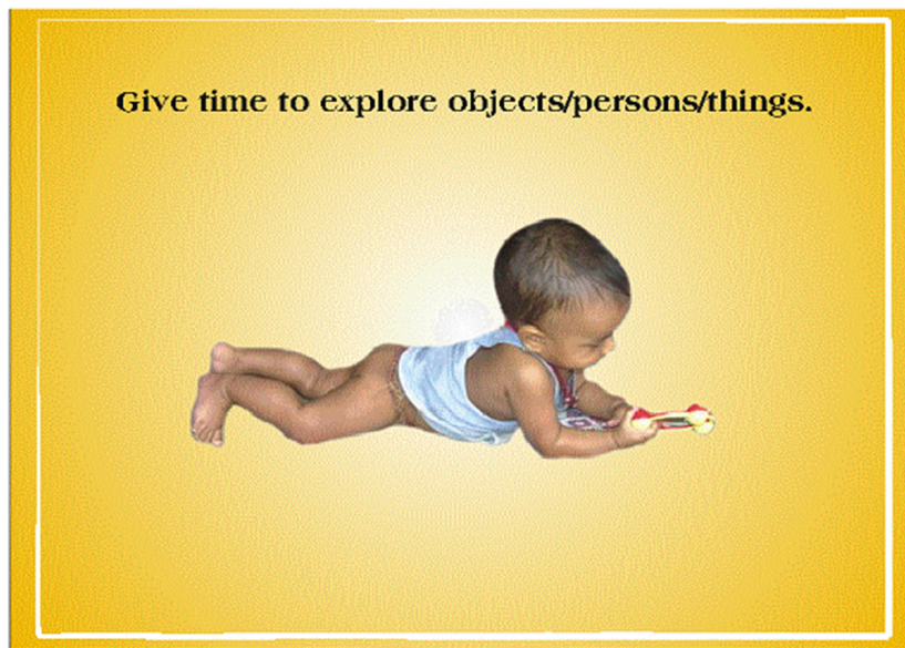
FIGURE 1 Example of a message displayed, with illustration, in the flip chart along with reinforcers, knowledge and motivations to be delivered and checking questions to ensure reception of message